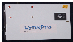
Fire - Lynx transmitter

The Nite-Alarm is activated by the LynxPro Fire – Lynx transmitter unit.