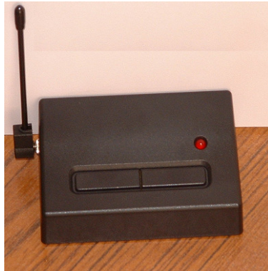
Table top transmitter:

Dimensions L 105mm W 70mm D 40mm Supports up to 99 pagers ( 1 – 99 ) LED indication transmission Option – internal aerial.